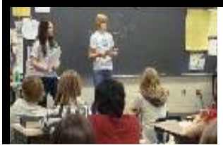
Students as Mentors

The Partners for a Drug Free Jasper Co. received a $300 stipend from SAMHSA (Substance and Mental Health Administration) to be used at the 5th and 6th grade level in the school system. The Pioneerz Clubs at both KV and Rensselaer agreed to implement the mentoring program as part of their retreat plan.